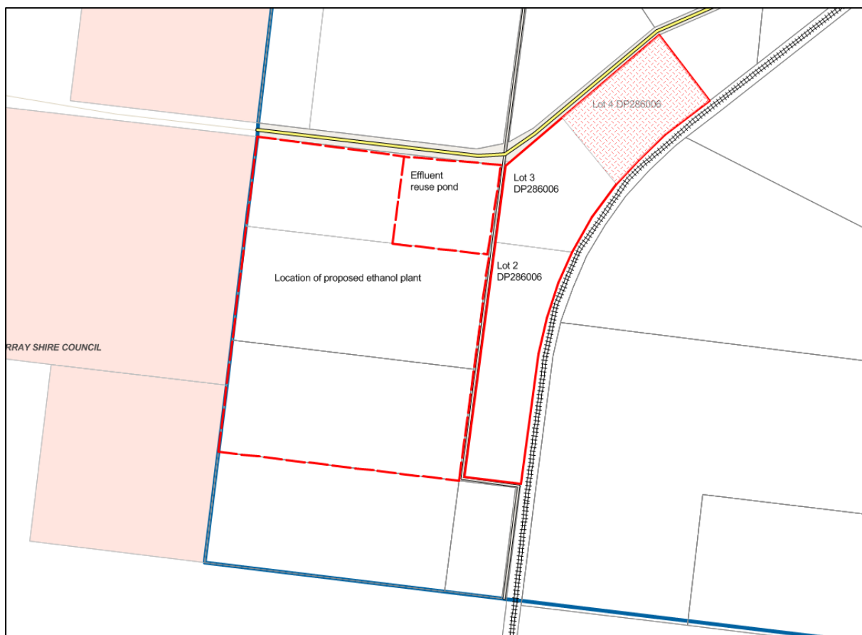
Figure 1 Location of Subject Site

The site is vacant and used for agriculture ie grazing of livestock. There is no significant vegetation on the site. The site is within the vicinity of the recently approved ethanol plant and Council's effluent dam. Figure 1 shows the location of the existing site.