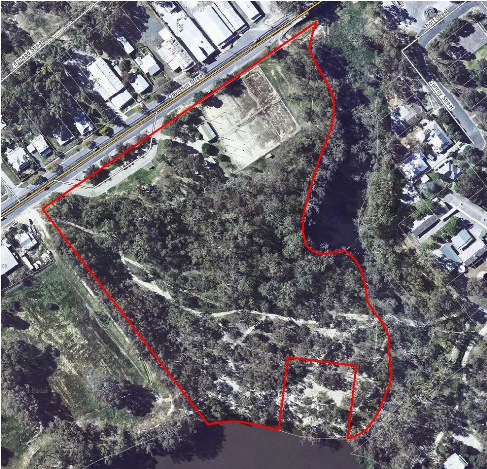
Figure 3 – Aerial Photograph of North Deniliquin Tennis Club Reserve (Reserve No. 46452)

The Reserve serves several community and visitor purposes. It has a rest area off the Cobb Highway that allows the public to stop and use the facilities at the reserve, such as the toilet, seating and barbecue.