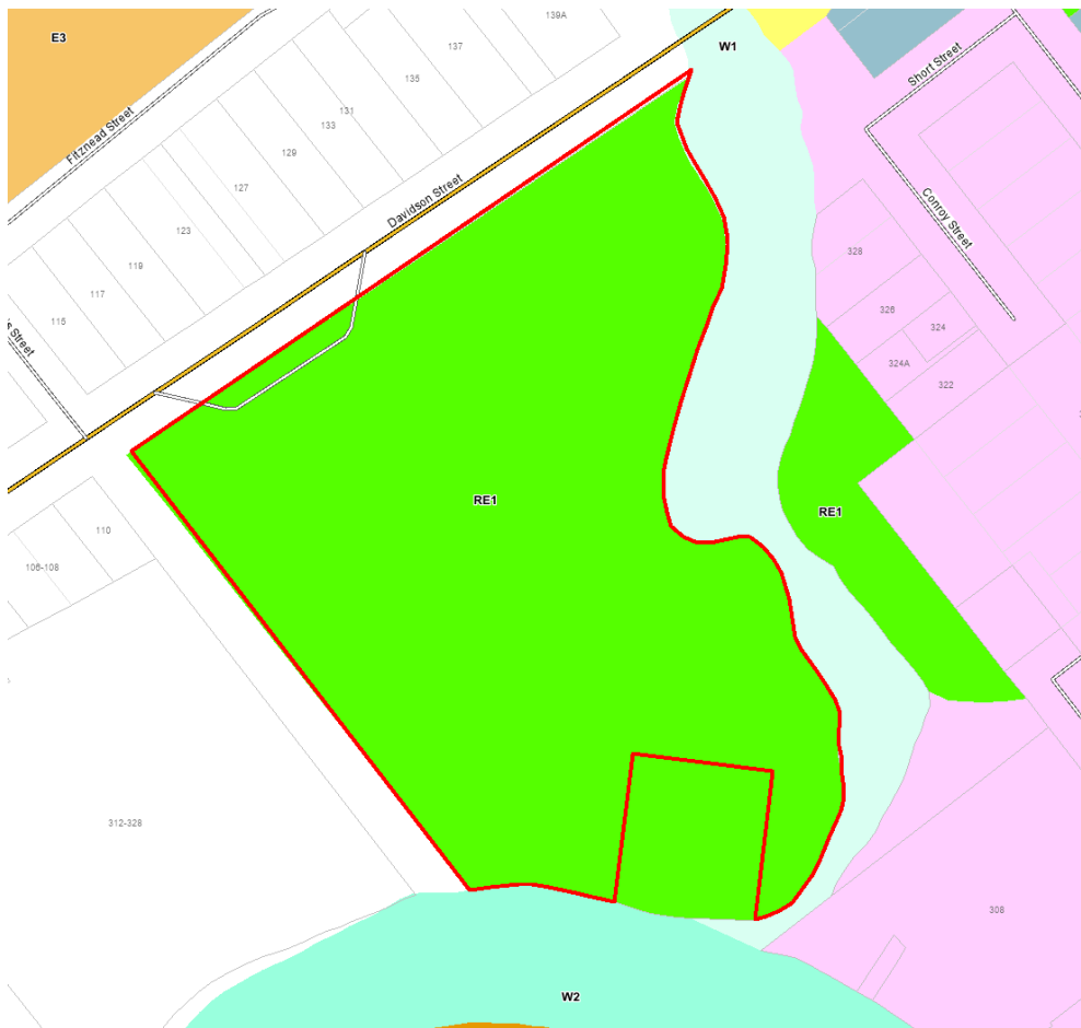
Figure 5 – Land Use Zones for Reserve No. 46452

The objectives of the land use zones are noted below in Table 1 .