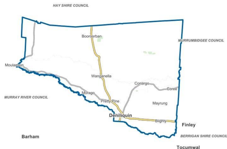
Figure 1 - Edward River Council Local Government Area

The Council provides services and support to a community of approximately 9,000 permanent residents across a region covering 8,881 square kilometres, including the town of Deniliquin and the six rural villages of Blighty, Booroorban, Conargo, Mayrung, Pretty Pine and Wanganella. A map of the local government area is shown below in Figure 1 .