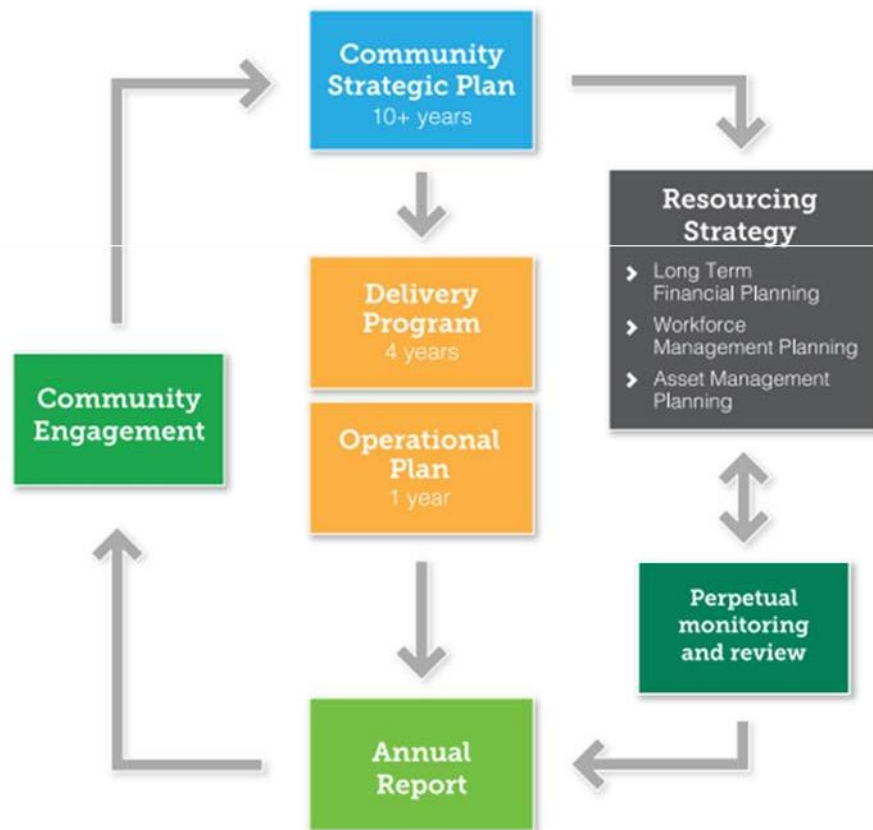
Figure 7 – Integrated Planning and Reporting Framework