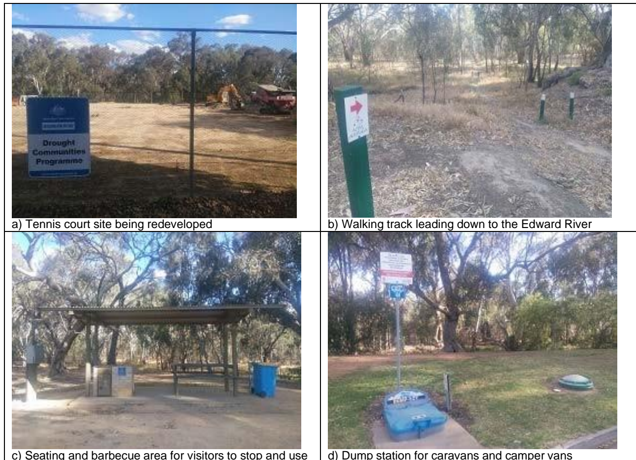
Figure 8 – Photographs of North Deniliquin Tennis Club Reserve.

Photographs of the reserve are shown below in Figure 8 .