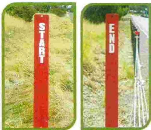
Red guideposts to identify locations of noxious weeds