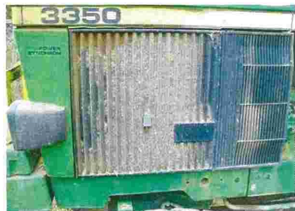
Tractor driven slasher – radiator loaded with weed seeds